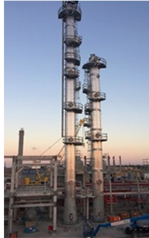
Pressure Vessel Section