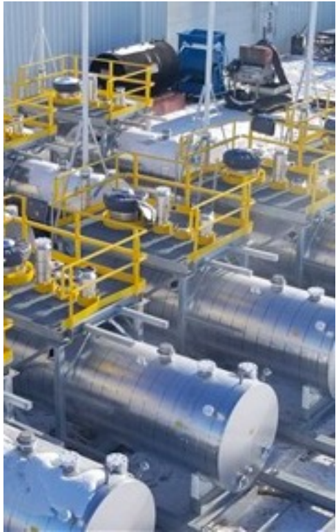
Shop Fabricated Tank Section