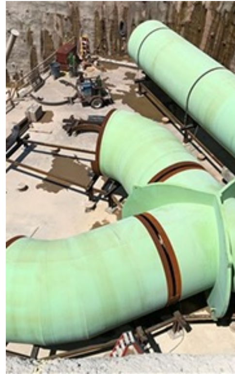
Steel Water Pipe Section