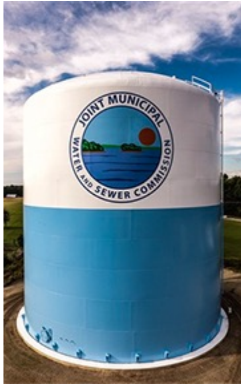
Field Erected Tank Section