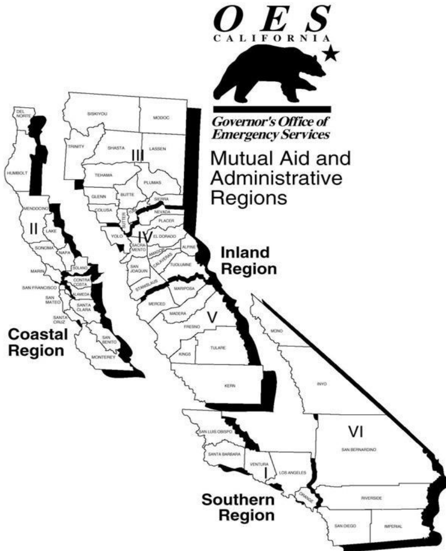
Figure 2. Administrative and Mutual Aid Regions of California

The Cal OES State Operations Center (SOC) coordinates State agency resources in response to the requests from the regional level and coordinates emergency assistance between the three administrative regions. The SOC also serves as the coordination and communication link between the State and the federal emergency response system. When resource requirements cannot be met with State resources, the State may request assistance from federal agencies or other States through the Emergency Management Assistance Compact (EMAC).