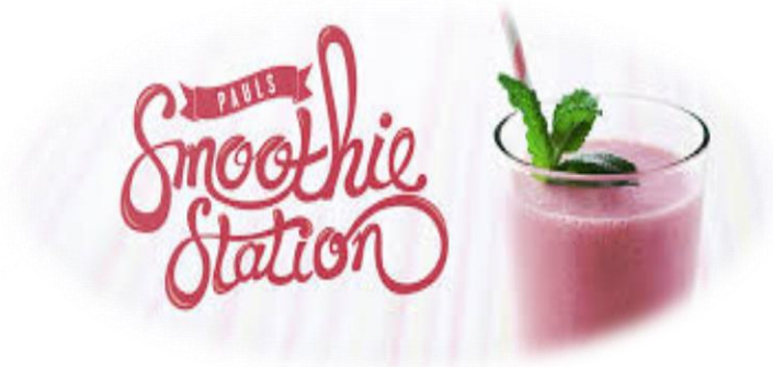
Smoothie Station Sponsor