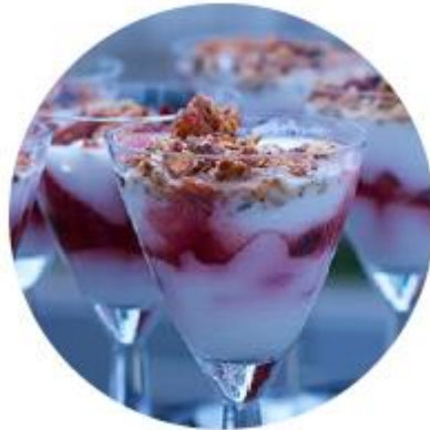
Breakfast Parfait Sponsor