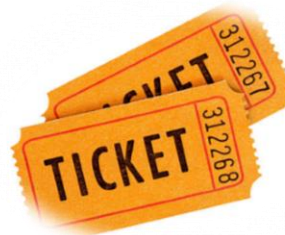
Drink Ticket Sponsor