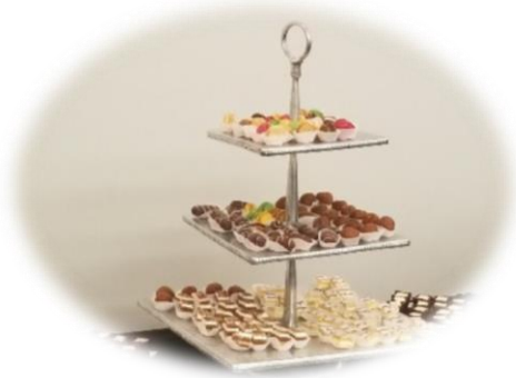
Dessert Station Sponsor