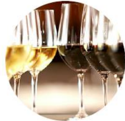
Wine Station Sponsor